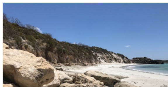
Note the burnt trees on ridge line @ Vivonne Bay, Kangaroo Island

Photo features Highlanders Margaret-Anne, Rick and Katie BUT there were other helpers who were camera shy. Thanks to them too!