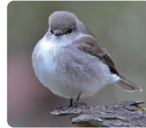
Jacky Winter Microeca fascians * 13 (CT) ☒ ☒ ☒ ☒