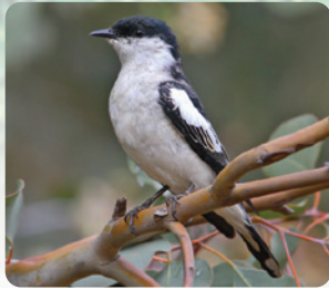
White-winged Triller Lalage sueurii 18 (CT) ☒ ☒ ☒ ☒ ☒