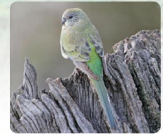
Red-rumped Parrot (female) Psephotus haematonotus 27 (CT) ☞ ☞ ☞ ☞ ☞