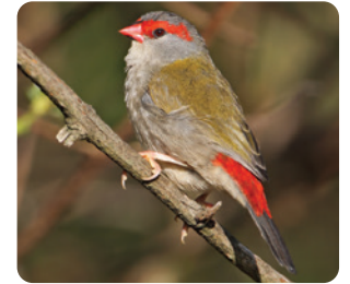
Red-browed Finch Neochmia temporalis 12 (CT) ☒ ☒ ☒ ☒