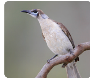
Little Friarbird Philemon citreogularis 27 (DI) 🌳 🌿 🦉 🦅 🦜