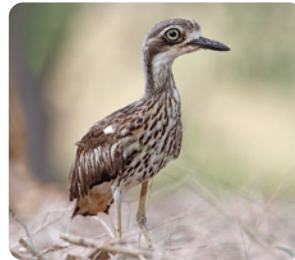
Bush Stone-curlew Burhinus grallarius EN L * 56 (CT) ☞ ☞