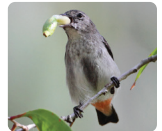
Mistletoebird (female) Dicaeum hirundinaceum 11 (CT) ☒ ☒ ☒ ☒