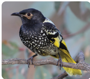
Regent Honeyeater Anthochaera phrygia - Nationally Endangered CR L * 22 (CT) 🌳 🌿 🦉 🦅 🦜