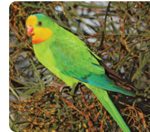
Superb Parrot (male) Polytelis swainsonii – Nationally Vulnerable EN L * 40 (DI) ☞ ☞ ☞ ☞ ☞ ☞ ☞