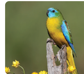
Turquoise Parrot (male) Neophema pulchella NT L * 21 (DI) ☞ ☞ ☞ ☞ ☞ ☞