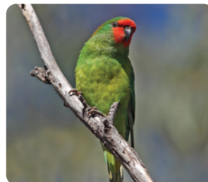
Little Lorikeet Glossopsitta pusilla 17 (CT) ☞ ☞ ☞ ☞