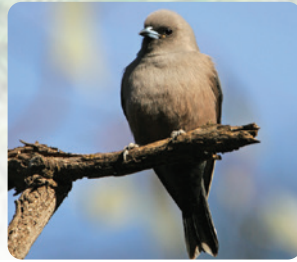
Dusky Woodswallow Artamus cyanopterus 18 (DI) ☒ ☒ ☒ ☒ ☒ ☒