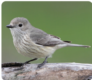
Rufous Whistler (female) Pachycephala rufiventris 17 (DI) ☒ ☒ ☒ ☒