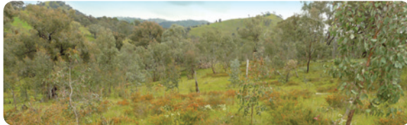
Natural regeneration with a diversity of habitats provides important refuge for woodland birds

Since European settlement over 80% of woodlands in south-east Australia have been cleared. Remaining remnants are generally isolated and small, and often below the critical size needed to sustain healthy populations of many bird species.