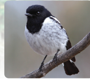
Hooded Robin (male) Melanodryas cucullata NT * 16 (CT) ☒ ☒ ☒ ☒