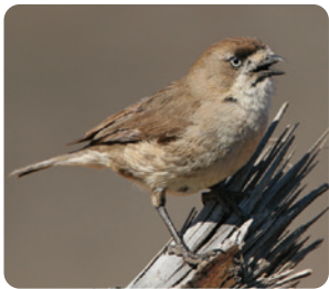
Southern Whiteface Aphelocephala leucopsis 10 (DI) 🌳 🌿 🦉 🦅 🦜