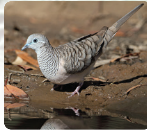
Peaceful Dove Geopelia striata 22 (CT) ☞ ☞ ☞ ☞