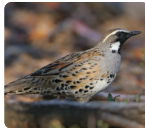
Spotted Quail-thrush Cinclosoma punctatum NT 26 (DI) ☞ ☞