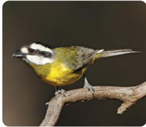
Crested Shrike-tit (female) Falculculus frontatus 18 (DI) ☒ ☒ ☒ ☒