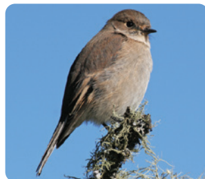
Flame Robin (female) Petroica phoenicea 14 (DI) ☒ ☒ ☒ ☒