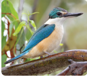
Sacred Kingfisher Todirhamphus sanctus 21 (CT) 🌳 🌿 🦉 🦅 🦜