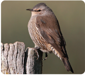
Brown Treecreeper Climacteris picumnus 16 (CT) 🌳 🌿 🦉 🦅 🦜