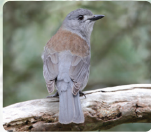
Grey Shrike-thrush Colluricincla harmonica 24 (CT) ☒ ☒ ☒ ☒ ☒ ☒ ☒ ☒