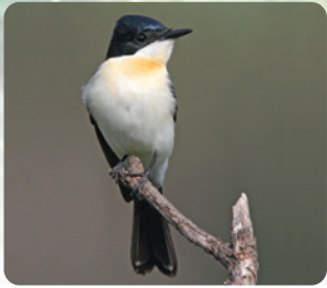
Restless Flycatcher Myiagra inquieta 20 (DI) ☒ ☒ ☒ ☒ ☒