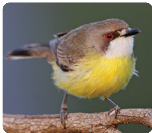
White-throated Gerygone Gerygone albogularis 10 (DI) 🌳 🌿 🦉 🦅 🦜