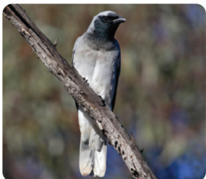
Black-faced Cuckoo-Shrike Coracina novaehollandiae 33 (CT) ☒ ☒ ☒