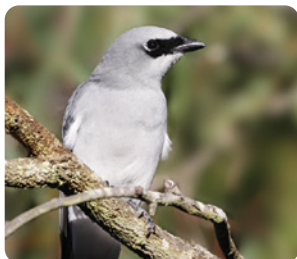
White-bellied Cuckoo-shrike Coracina papuensis 27 (DI) ☒ ☒ ☒