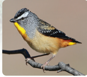
Spotted Pardalote Pardalotus punctatus 10 (CT) 🌳 🌿 🦉 🦅 🦜