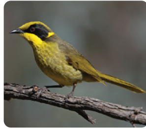
Yellow-tufted Honeyeater Lichenostomus melanops 18 (CT) 🌳 🌿 🦉 🦅 🦜