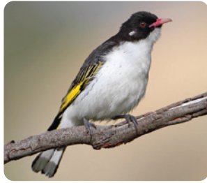
Painted Honeyeater Grantiella picta VU L * 15 (CT) 🌳 🌿 🦉 🦅 🦜