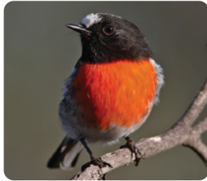
Scarlet Robin (male) Petroica boodang 13 (CT) ☒ ☒ ☒ ☒