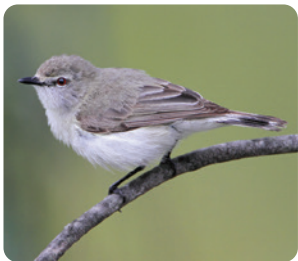
Western Gerygone Gerygone fusca * 11 (CT) 🌳 🌿 🦉 🦅 🦜