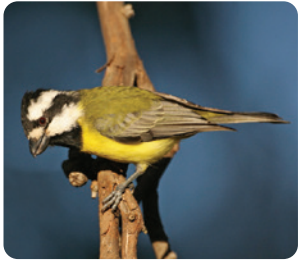
Crested Shrike-tit (male) Falculculus frontatus 18 (DI) ☒ ☒ ☒ ☒