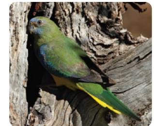
Turquoise Parrot (female) Neophema pulchella NT L * 21 (CT) ☞ ☞ ☞ ☞ ☞ ☞