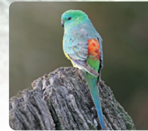
Red-rumped Parrot (male) Psephotus haematonotus 27 (CT) ☞ ☞ ☞ ☞ ☞