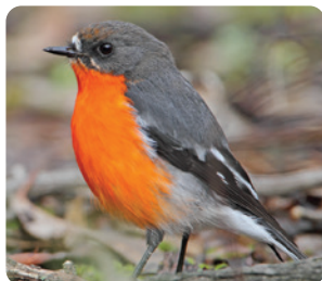
Flame Robin (male) Petroica phoenicea 14 (CT) ☒ ☒ ☒ ☒