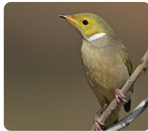
White-plumed Honeyeater Lichenostomus penicillatus 16 (DI) 🌳 🌿 🦉 🦅 🦜