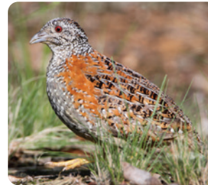
Painted Button-quail Turnix varia * 19 (CT) ☞ ☞ ☞ ☞