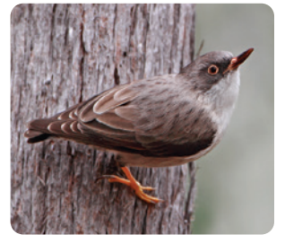
Varied Sittella Daphoenositta chrysoptera 11 (CT) 🌳 🌿 🦉 🦅 🦜