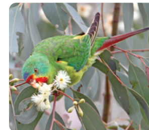
Swift Parrot Lathamus discolor – Nationally Endangered EN L * 25 (CT) ☞ ☞ ☞ ☞ ☞