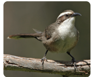
White-browed Babbler Pomatostomus superciliosus 20 (CT) 🌳 🌿 🦉 🦅 🦜