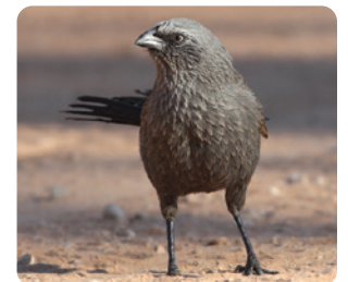
Apostlebird Struthidea cinerea 31 (CT) ☒ ☒ ☒ ☒