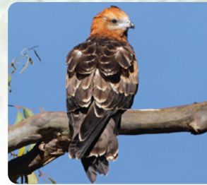
Square-tailed Kite Lophoictinia isura VU 52 (CT) ☞ ☞