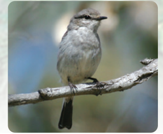
Hooded Robin (female) Melanodryas cucullata NT * 16 (DI) ☒ ☒ ☒ ☒