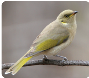
Fuscous Honeyeater Lichenostomus fuscus * 15 (DI) 🌳 🌿 🦉 🦅 🦜