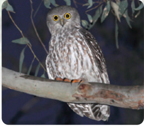
Barking Owl Ninox connivens EN L * 41 (CT) 🌳 🌿 🦉 🦅 🦜