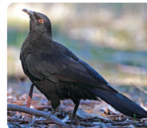
White-winged Chough Corcorax melanorhaphos 45 (CT) ☒ ☒ ☒ ☒