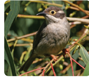
Brown-headed Honeyeater Melithreptus brevirostris * 13 (DI) 🌳 🌿 🦉 🦅 🦜