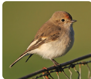
Red-capped Robin (female) Petroica goodenovii * 12 (DI) ☒ ☒ ☒ ☒