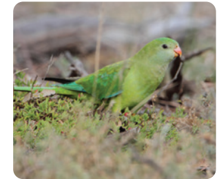
Superb Parrot (female) Polytelis swainsonii – Nationally Vulnerable EN L * 40 (CT) ☞ ☞ ☞ ☞ ☞ ☞ ☞