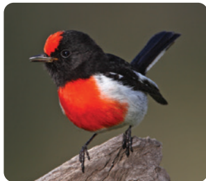
Red-capped Robin (male) Petroica goodenovii * 12 (CT) ☒ ☒ ☒ ☒