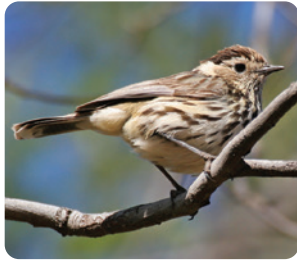
Speckled Warbler Pyrrholaemus sagittatus VU L * 12 (DI) 🌳 🌿 🦉 🦅 🦜