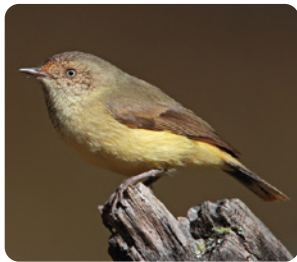
Buff-rumped Thornbill Acanthiza reguloides 11 (CT) 🌳 🌿 🦉 🦅 🦜