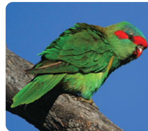
Musk Lorikeet Glossopsitta concinna 22 (CT) ☞ ☞ ☞ ☞ ☞