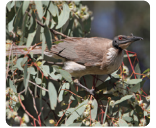
Noisy Friarbird Philemon corniculatus 33 (CT) 🌳 🌿 🦉 🦅 🦜