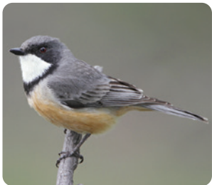
Rufous Whistler (male) Pachycephala rufiventris 17 (DI) ☒ ☒ ☒ ☒