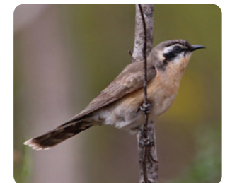
Black-eared Cuckoo Chalcites osculans NT 19 (CT) ☞ ☞ ☞