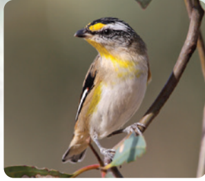
Striated Pardalote Pardalotus striatus 10 (CT) 🌳 🌿 🦉 🦅 🦜