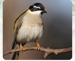
Black-chinned Honeyeater Melithreptus gularis NT * 15 (DI) 🌳 🌿 🦉 🦅 🦜