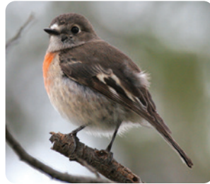
Scarlet Robin (female) Petroica boodang 13 (DI) ☒ ☒ ☒ ☒