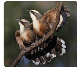
Grey-crowned Babbler Pomatostomus temporalis EN L * 27 (DI) 🌳 🌿 🦉 🦅 🦜