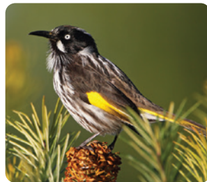
New Holland Honeyeater Phylidonyris novaehollandiae 18 (CT) 🌳 🌿 🦉 🦅 🦜